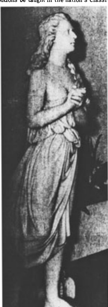
"HAGAR" BY EDMONIA LEWIS of sculpture

Today, the Negro is asking himself the question, "Who am I?" This search is causing him to look backward as he moves forward. Negro-Americans are becoming aware that they have made important contributions to American life and culture. They are also insisting that their history and contributions be taught in the nation's classrooms.