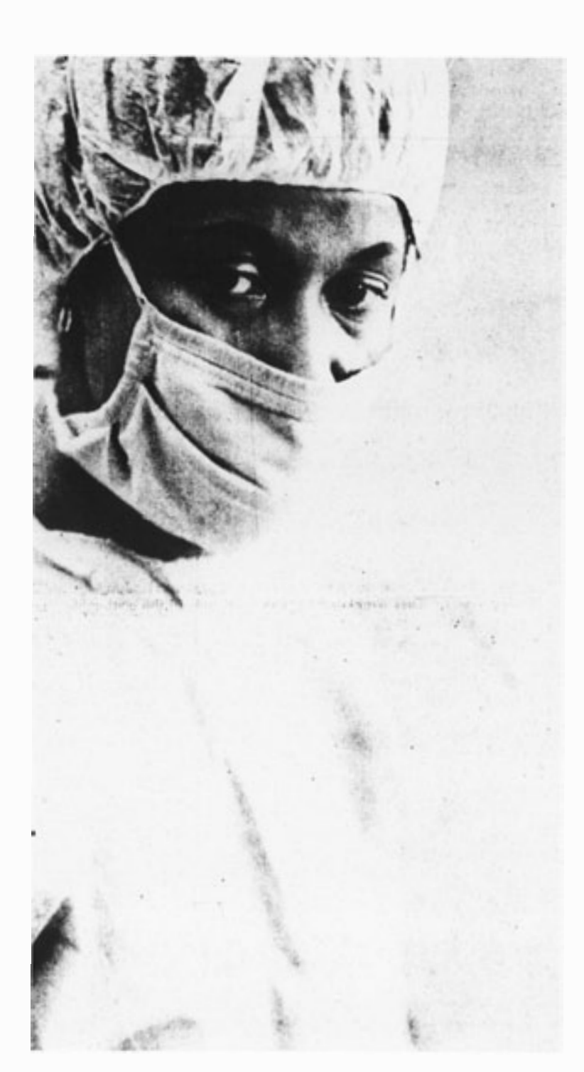
Scalpel, Clamp, Suture