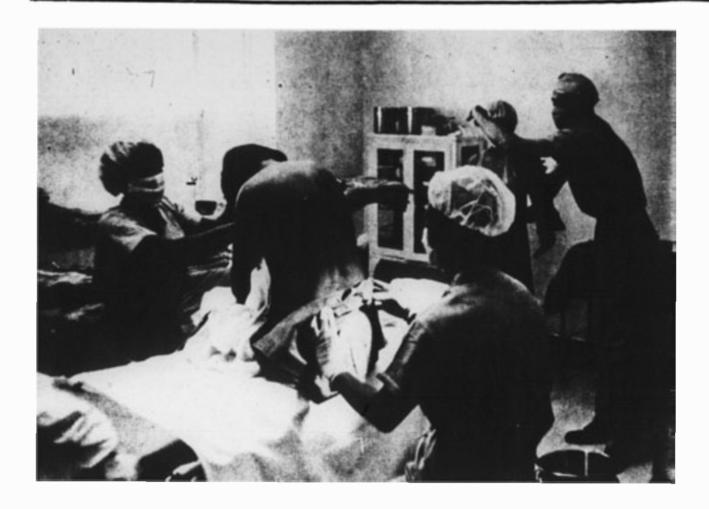
Inside an Operating Room