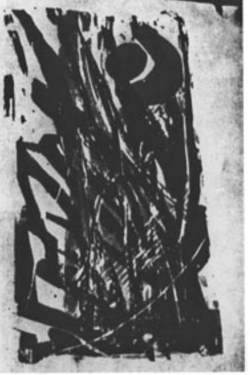
ONE OF LINTON'S WOODCUTS

This year he is taking all academic courses at