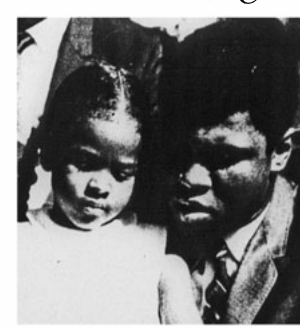
MUHAMMAD ALI AND ADMIRER

"We cannot tell YOU that YOU don't own any factories, because YOU own factories," the champ replied. "What we (Black Muslims) have to say applies only to black