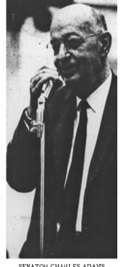
SENATOR CHARLES ADAMS

as the Popular Act of 1965. The legislature canalsopass resolutions and constitutional amendments. Resolutions express the feelings of one or both houses, but they are not the law. For example, the Senate might pass a resolution congratulating the University of Alabama football team for winning the national championship.