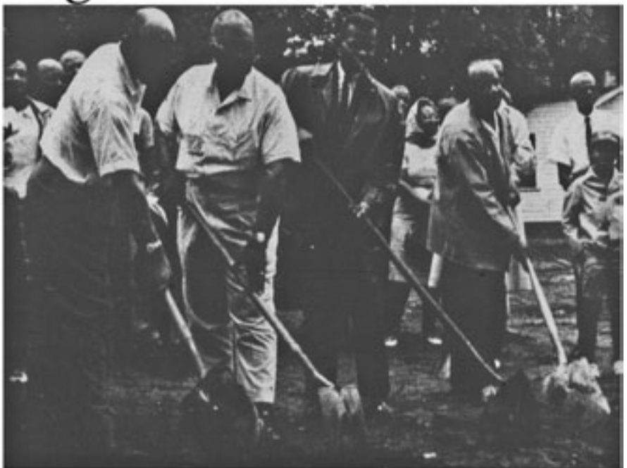
B&P LEAGUE MEMBERS BREAK GROUND FOR NEW SUPERMARKET