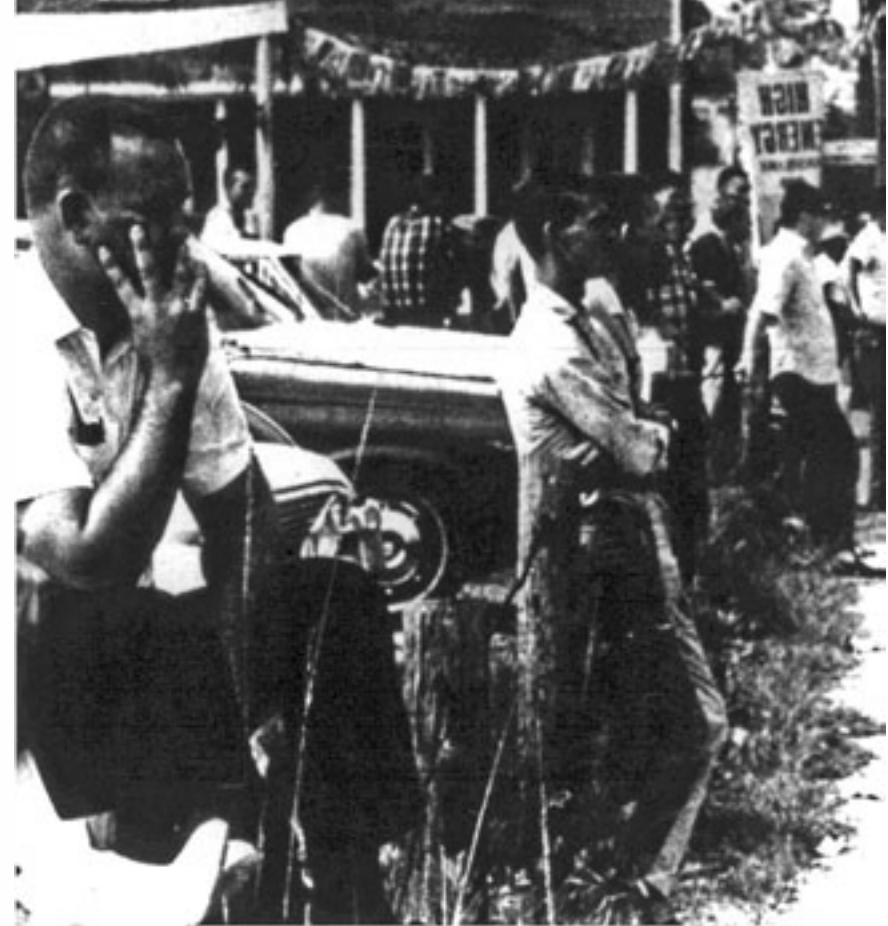
WHITE ONLOOKERS WATCH NEGRO MARCHERS

The Klan has already shown what it will do, even to people who only speak but for moderation. This January six white citizens of Bogalusa tried the first step of a moderate solution to racial problems. They invited an Arkansas authority on race relations to speak in Bogalusa before an integrate udience.