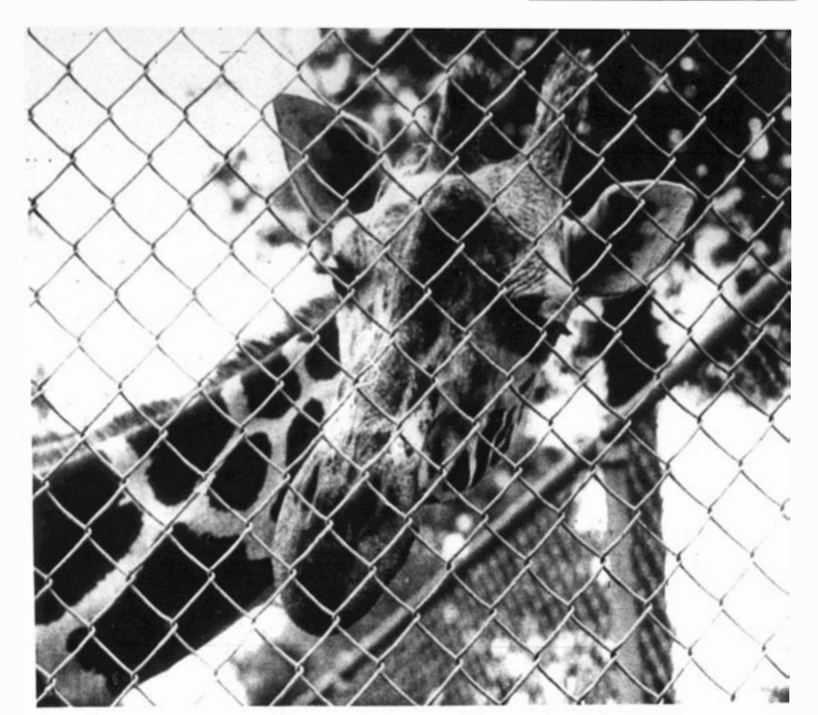
The Birmingham Zoo